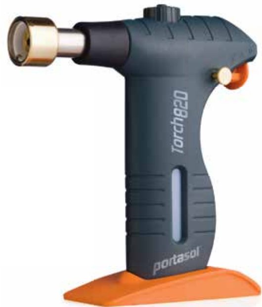
Model # HP820