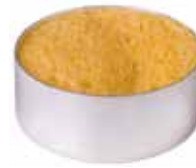
P50T-9 Sponge & Tray