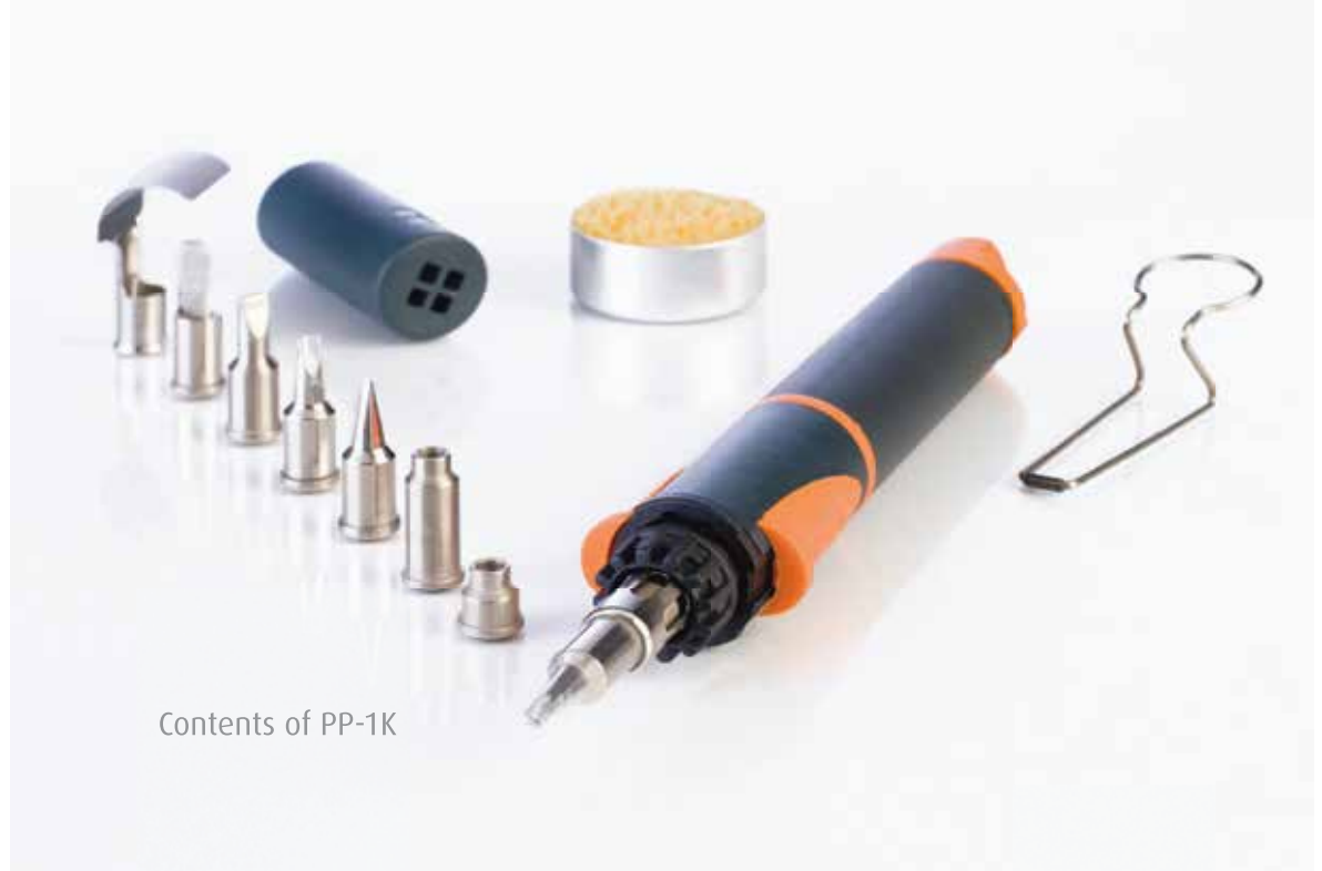
Contents of PP-1K