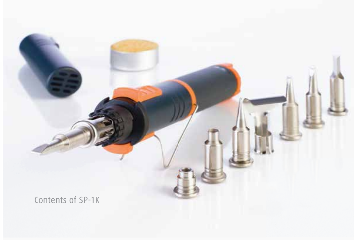
Contents of SP-1K