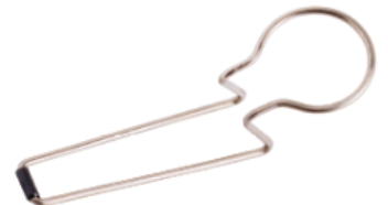
P50T-8 Extra Wire Stand