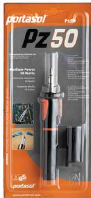
Pz50 Soldering iron fitted with: Tip Body, 1mm Tiplet, 2.4mm DF Tiplet, 3.2mm DF Tiplet, 4.8 mm DF Tiplet, Hot Knife Tiplet & Instructions