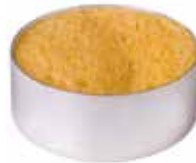
P50T-9 Sponge & Tray