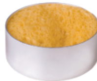
P50T-9 Sponge & Tray