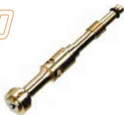
HP820-1 Jet Assembly