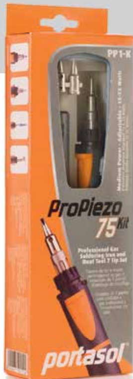
Kit: Model # PP-1K