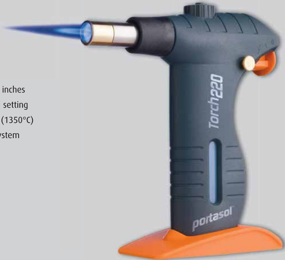
Jet assembly Torch 220