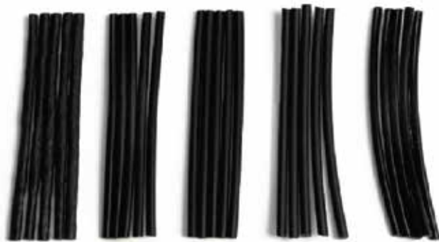
Plastic Welding Rods (25 per pack)