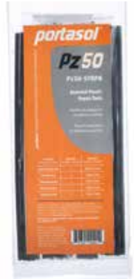
Pz50 Starter Pack (Assorted plastic repair rods)