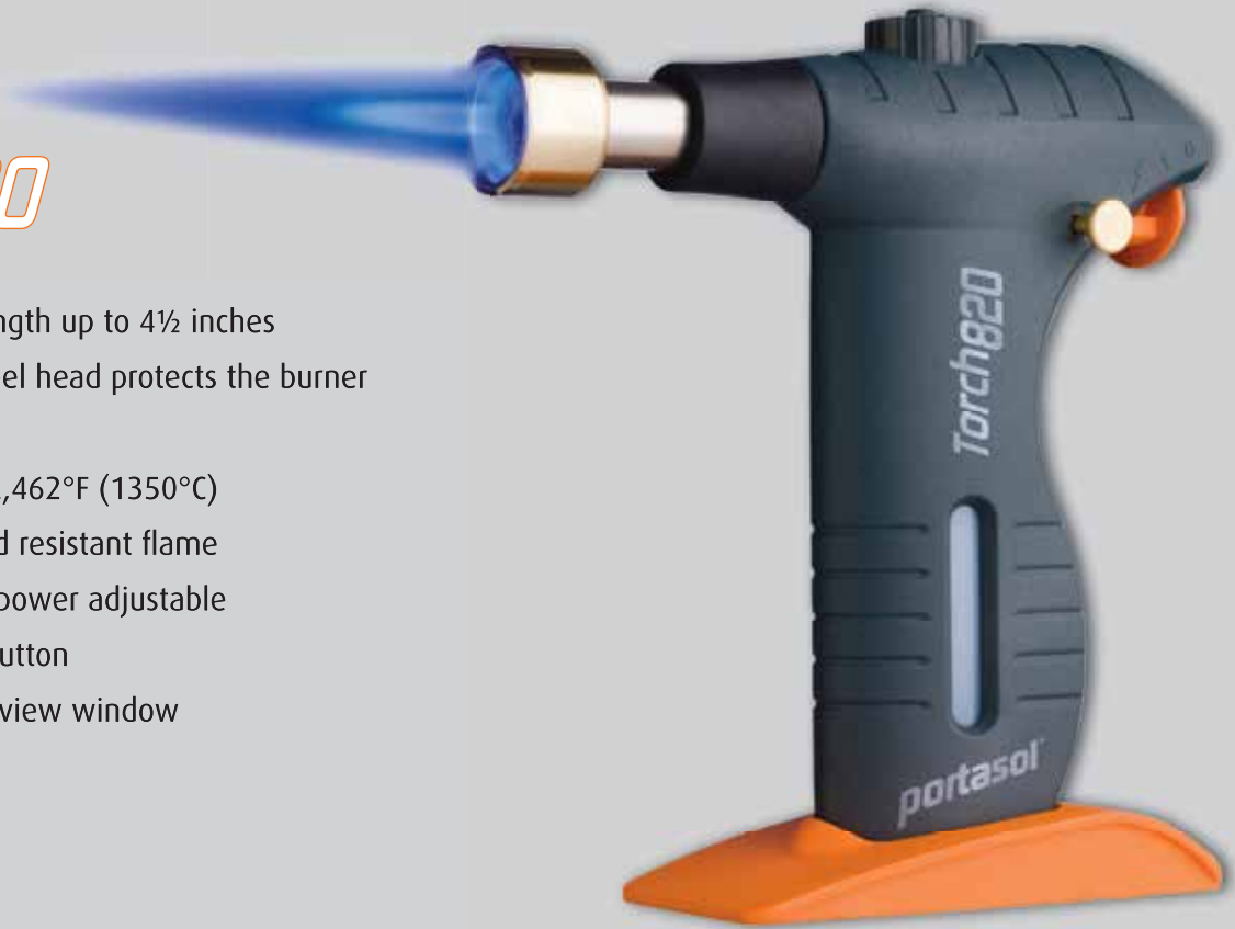
Jet assembly Torch 820