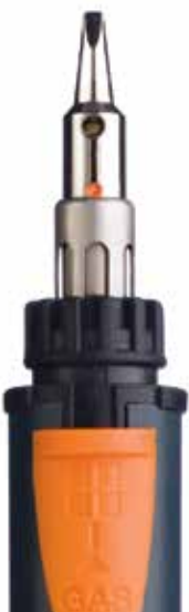
ProPiezo 75 with 3/32" (2.4mm) df tip

ProPiezo 75 fitted with: 1/32" (1.0mm) df tip, 3/32" (2.4mm) df tip, 1/8" (3.2mm) df tip, 3/16" (4.8mm) df tip, hot air blower & deflector, hot knife, flame tip, cleaning sponge, stand, storage case and instructions.