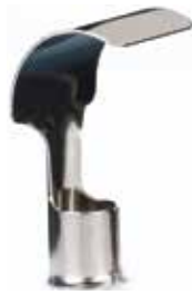
SPT-13 Hot Air & Deflector