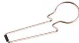
P50T-8 Extra Wire Stand