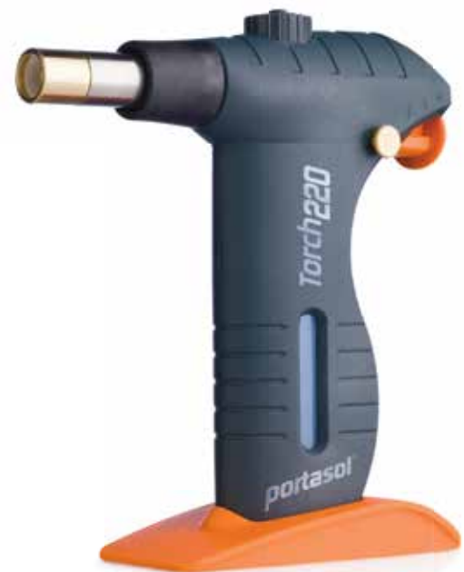
Model # GT220