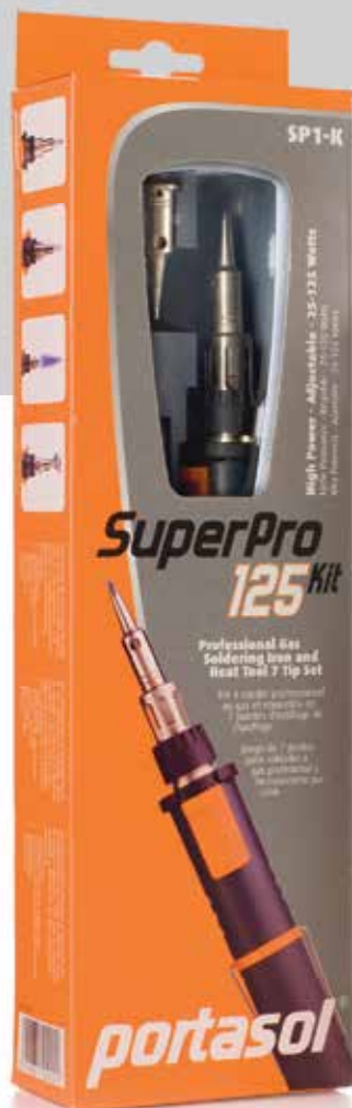
Kit: Model # SP-1K

Anti-static / ESD safe, this tool will be a versatile addition to your toolbox.