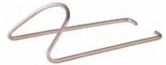
SPT-15 Wire Stand