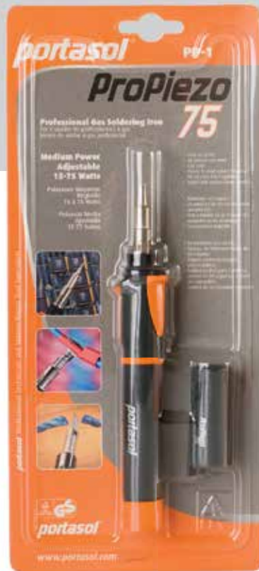
Single: Model # PP-1

A selection of soldering spare tips and parts