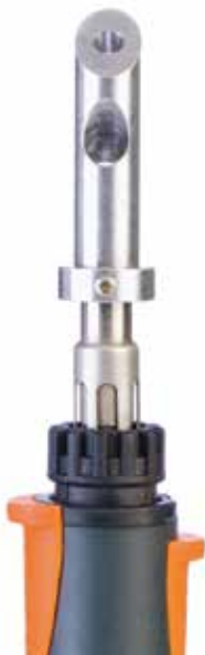
Plastic welding tip