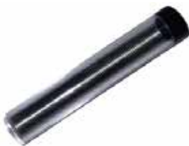
Solder Tube 1mm