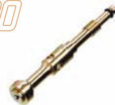
GT220-1 Jet Assembly