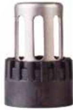
SPT-18 Retainer Tube Collet