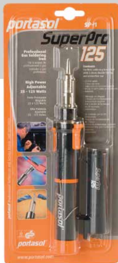
Single: Model # SP-1

A selection of soldering spare tips and parts