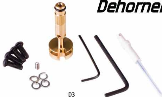
D3 Repair Pack