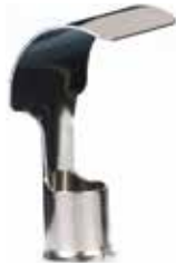
PPT-13 Hot Air & Deflector